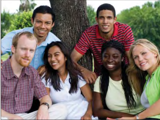
Increasing waves of international migration have meant that urban areas are becoming multicultural