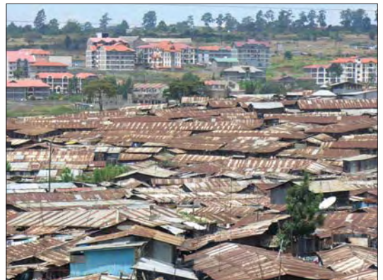
Urban planning can address the issue of inequality through redistributive policies

In order to cope with the effects of climate change through rising sea levels, cities all over the world, but especially in developing countries, will need to implement innovative adaptation and mitigation strategies. Urban planning can contribute to implementing some of these strategies. Adaptation for cities entails such diverse actions as increasing the resilience of infrastructure, changing the location of settlements, and implementing practices that enhance sustainable development. Mitigating climate change