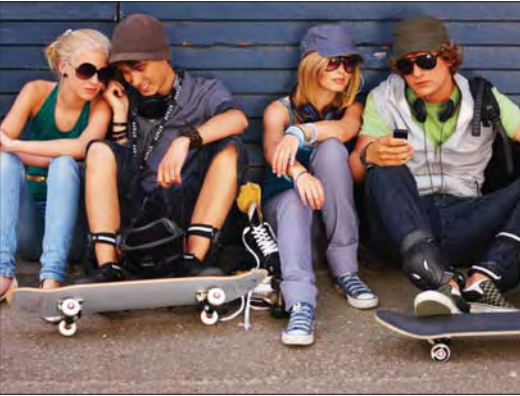
Urban planning will have to pay attention to the needs of the youthful population