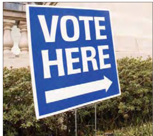
The electoral process enables the expression of citizens' preferences

However, consultation implies that key decisions are taken by external agents, who may or may not take into account all the views expressed, especially those of socially marginal groups. Moreover, in both developed and developing countries, consultation is widely used to legitimize decisions that have already been made and its outcomes are used selectively or potentially disregarded by those in power. Thus, in addition to its functional value, participation may be used purely as a tokenistic, legitimizing device.