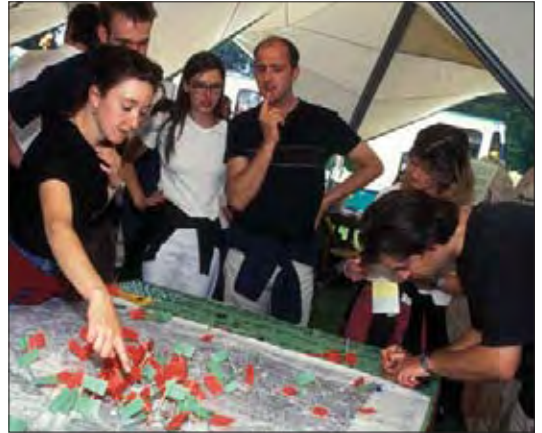
Local residents should be able to determine plan implementation and resource distribution

A variety of terms are used to refer to local participatory planning approaches. In practice, though, they have common characteristics, especially a focus on identifying needs and priorities, devising solutions, and agreeing on arrangements for implementation, operation and maintenance. The process of identifying needs and priorities is often called participatory urban appraisal, while arriving at proposals and implementation arrangements is often called community action planning.