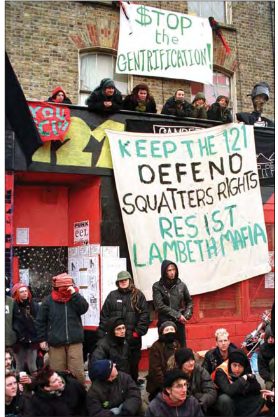
Street politics give citizens a voice, especially in developed countries

In recent years, a great variety of tools and techniques for citizen participation in urban planning have been widely applied at both city and local levels in developed countries. In some countries such as Canada, the US and Australia, governments have provided technical and financial support for ordinary citizens to participate in public review processes. Even so, it is not always easy to secure wide citizen participation, with the result that specific organized interests exert more influence to advance their own interests and some social groups are under-represented (e.g. women, youth and ethnic minorities). Therefore, more extensive and radical participation in decision making remains exceptional.